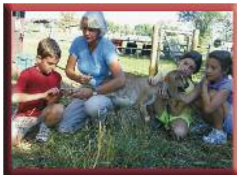
THIS CAMP MUST COMPLY WITH REGULATIONS OF THE MASSACHUSETTS DEPT. OF PUBLIC HEALTH AND BE LICENSED BY THE BOARD OF HEALTH.