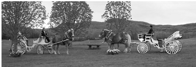
CHESTNUT GROVE AND STONE BENCH

The placement of the athletic field, which takes into consideration the master plan for future buildings, required the relocation of the chestnut grove and the lovely stone bench gifted by the class of '93. A favorite shady spot for students and families, the grove is being relocated to the knoll which rises up on the south border of the school, affording views of the campus on one side and the pastures and rolling fields on the other.